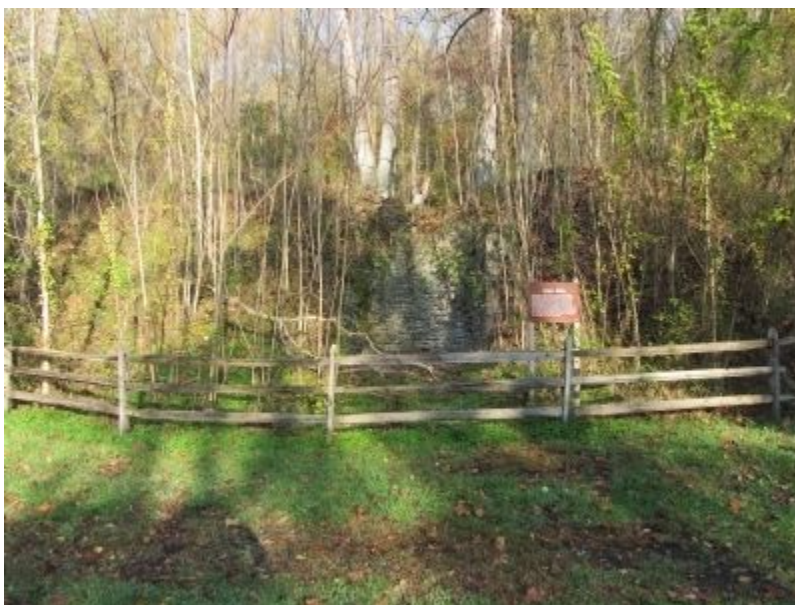
By F. Robby, October 22, 2011