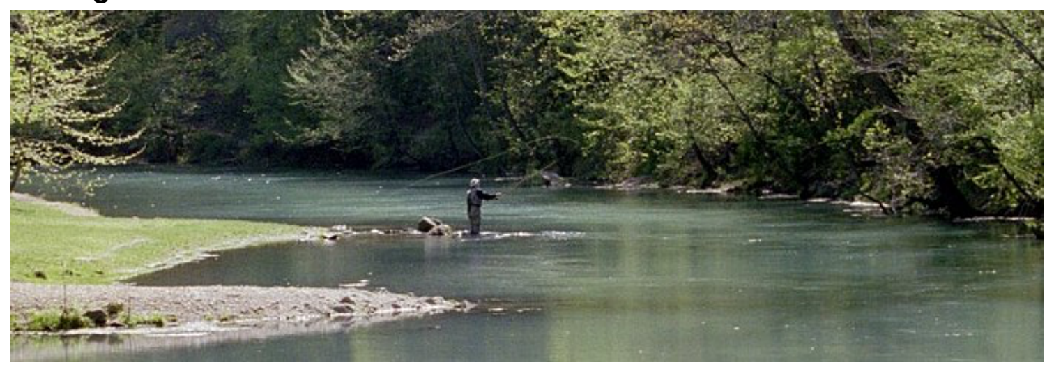
Fly casting, Maramec Spring Branch, Missouri

Unlike other <u>casting</u> methods, fly fishing can be thought of as a method of casting line rather than lure. Non-flyfishing methods rely on a lure's weight to pull line from the reel during the forward motion of a cast. By design, a fly is too light to be cast, and thus simply follows the unfurling of a properly cast fly line, which is heavier and tapered and therefore more castable than lines used in other types of fishing. [29]