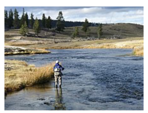
Fly angler on the Firehole River, USA

Fly fishing for trout is a very popular sport, which can be done using any of the various methods and any of the general types of flies. Many of the techniques and presentations of fly fishing were first developed in fishing for trout. There is a misconception that all fly fishing for trout is done on the surface of the water with "dry flies." In most places, especially heavily fished trout areas, success usually comes from fly fishing using flies called "nymphs" that are designed to drift close to the riverbed, also called "nymphing". A trout feeds below the water's surface nearly 90 percent of the time. Trout usually only come to the surface when there is a large bug hatch