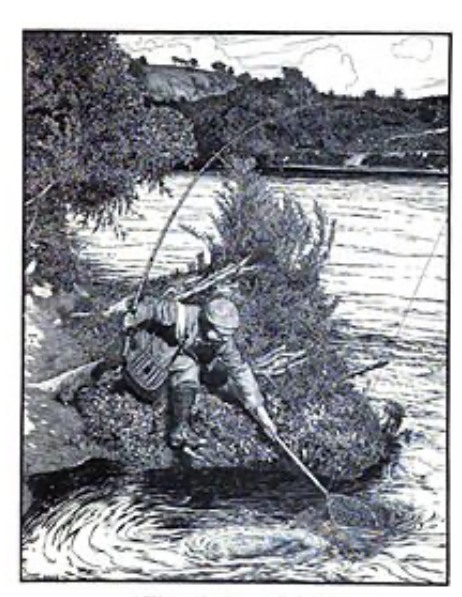
" The end of a stiff fight."

Scotland, many anglers also favored wet-fly fishing, where the technique was more popular and widely practiced than in southern England. One of Scotland's leading proponents of the wet fly in the early-to-mid 19th century was W.C. Stewart, who published "The Practical Angler" in 1857.