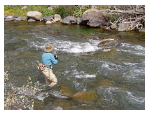
Fly fishing on the <u>Gardner River</u> in Yellowstone National Park, USA

Trout tend mostly to feed underwater. When fishing deeper waters such as rivers or lakes, putting a fly down to the trout may be more successful than fishing on the surface, especially