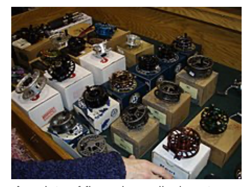
A variety of fly reels on display at a fly fishing show