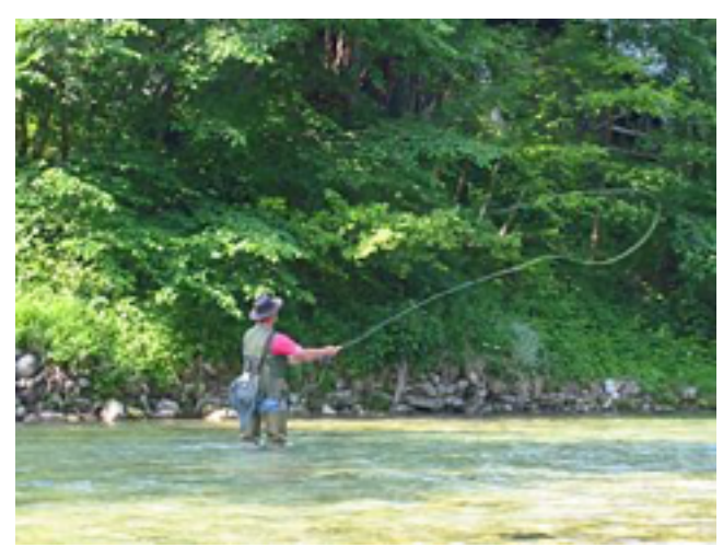
Fly fishing in a river

Fly fishing can be done in fresh or saltwater. North Americans usually distinguish freshwater fishing between cold-water species (trout, salmon) and warm-water species, notably bass. In Britain, where natural water temperatures vary less, the distinction is between game fishing for trout and salmon versus coarse fishing for other species. Techniques for fly fishing differ with habitat (lakes and ponds, small streams, large rivers, bays and estuaries, and open ocean.)