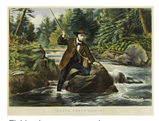
Fishing became a popular recreational activity in the 19th century. Print from Currier and Ives.

by supplying angling equipment via the circulation of his tackle catalogs, distributed to a small but devoted customer list.