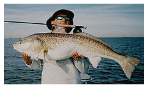
A <u>red drum</u> caught on a fly rod, Louisiana, USA

Saltwater fly fishing is typically done with heavier tackle than that which is used for freshwater trout fishing, both to handle the larger, more powerful fish, and to accommodate the casting of larger and heavier flies. Saltwater fly fishing typically employs the use of wet flies resembling baitfish, crabs, shrimp and other forage. However, saltwater fish can also be caught with poppers and other surface lure similar to those used for freshwater bass fishing, though much larger. Saltwater species sought and caught with fly tackle include: bonefish, redfish or red drum, permit, snook, spotted sea trout, tuna, dorado