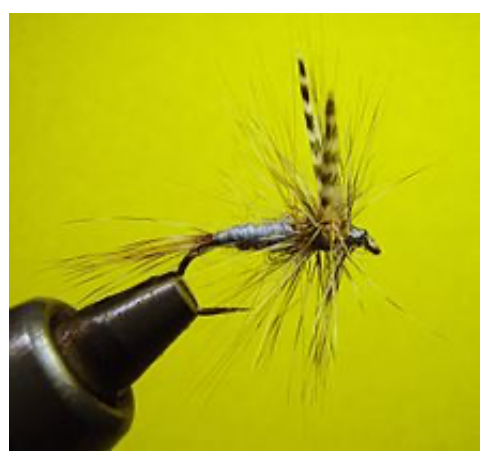
An Adams dry fly

Dry flies may be "attractors", such as the Royal Wulff, or "natural imitators", such as the elk hair caddis, a caddisfly imitation [33] A beginner may wish to begin with a fly that is easy to see such as a Royal Wulff attractor or a mayfly imitation such as a parachute adams. The "parachute" on the parachute adams makes the fly land as softly as a natural on the water and has the added benefit of making the fly very visible from the surface. Being able to see the fly is especially helpful to the beginner. The fly should land softly, as if dropped onto the water, with the leader fully extended from the fly line. Due to rivers having faster and slower currents often running side by side, the fly can over take or be overtaken by the line, thus disturbing the fly's drift. Mending is a technique whereby one lifts and moves the part of the line that requires re-aligning