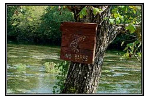
"No Barbs" sign on Ribnik river in Bosnia

Releasing wild trout helps preserve the quality of a fishery. Trout are more delicate than most fish and require careful handling. When a trout has been caught but the hook is still embedded, wet your hands before handling the fish. Dry hands stick to the <u>adhesive</u> slime coating the fish and can pull off its scales. It is <u>preferred</u> for the fish to remain in the water when removing the hook, but holding the trout out of the water will not be lethal, provided the hook is removed quickly and the trout is returned immediately.