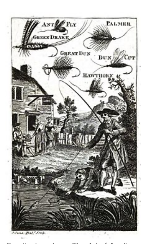
Frontispiece from The Art of Angling by Richard Brookes, 1790

In southern England, dry-fly fishing acquired an elitist reputation as the only reliable method of fishing the slower, clearer rivers of the south such as the <u>River Test</u> and the other chalk streams concentrated in <u>Hampshire</u>, <u>Surrey</u>, <u>Dorset</u> and <u>Berkshire</u> (see <u>Southern England Chalk Formation</u> for the geological specifics). The weeds found in these rivers tend to grow very close to the surface, and it was necessary to develop new techniques that would keep the fly and the line on the surface of the stream. These methods became the foundation of all later dry-fly developments. <u>F. M. Halford</u> was a major exponent and is generally accepted as "The Father of Modern Dry Fly Fishing." [25][26]