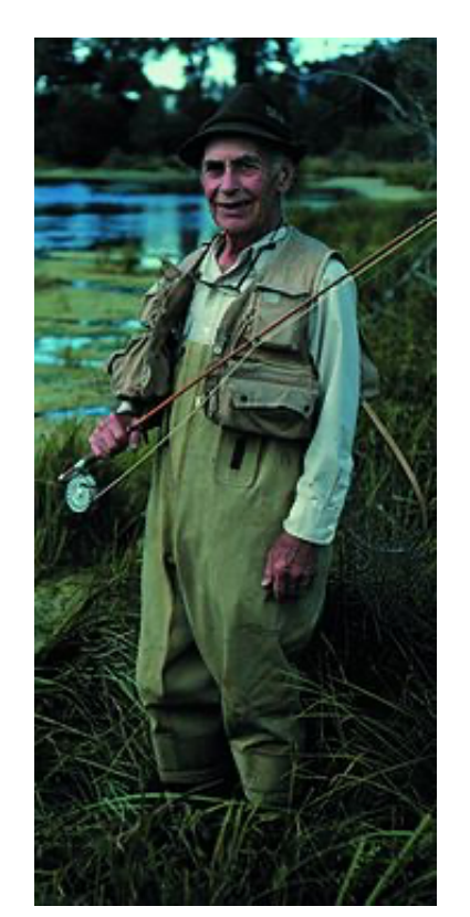
Fly angler circa 1970s

Dropping the fly onto the water and its subsequent movement on or beneath the surface is one of fly fishing's most difficult aspects; the angler is attempting to cast in such a way that the line lands smoothly on the water and the fly appears as natural as possible. At a certain point, if a fish does not strike, depending upon the action of the fly in the wind or current, the angler picks up the line to make another presentation. On the other hand, if a fish strikes, the angler pulls in line while raising the rod tip. This "sets" the hook in the fish's mouth. The fish is played either by hand, where the angler continues to hold the fly line in one hand to control the tension applied to the fish, or by