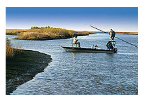
Saltwater Fly Fishing in Louisiana

Many saltwater species, particularly large, fast and powerful fish, are not easily slowed down by "palming" the hand on the reel. Instead, a purpose-made saltwater reel for these species must have a powerful drag system. Furthermore, saltwater reels purpose-made for larger fish must be larger, heavier, and <u>corrosion-resistant</u>; a typical high-quality saltwater reel costs US$500.00 or more. Corrosion-resistant equipment is key to durability in all types of saltwater fishing, regardless of the size and power of the target species.