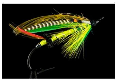
Green Highlander, a classic salmon fly

In broadest terms, flies are categorised as either imitative or attractive. Imitative flies resemble natural food items. Attractive flies trigger instinctive strikes by employing a range of characteristics that do not necessarily mimic prey items. Flies can be fished floating on the surface (dry flies), partially submerged (emergers), or below the surface (nymphs, streamers, and wet flies). A dry fly is typically thought to represent an insect landing on, falling on (terrestrials), or emerging from, the water's surface as might a grasshopper, dragonfly, mayfly, ant, beetle, stonefly or caddisfly. Other surface flies include poppers and hair bugs that might resemble mice, frogs, etc. Sub-surface flies are designed to resemble a