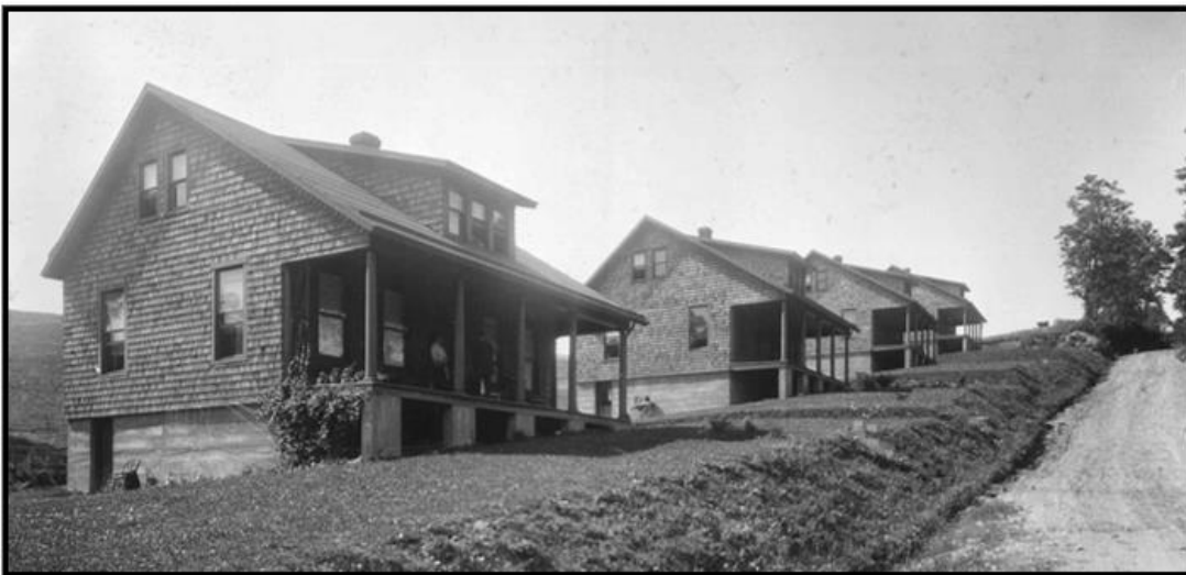
Warren cottages, so-called Bungalows at Warren, built by Warren Manufacturing Co. during WW I. The houses were saved and moved to Bosley Ave. in Cockeysville. Main Street climbs hill toward Poplar Hill Road, on right.