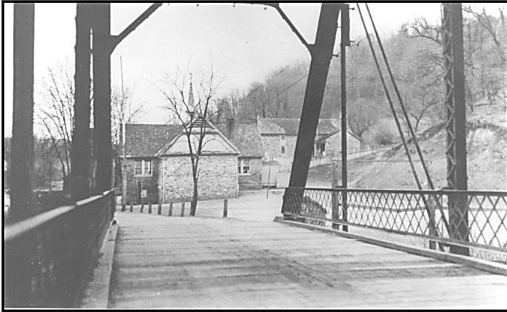
View of Warren school, from bridge over Gunpowder Falls.