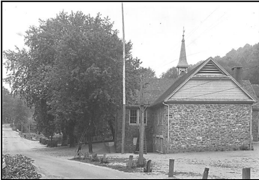
Warren Public school on Warren Road in village