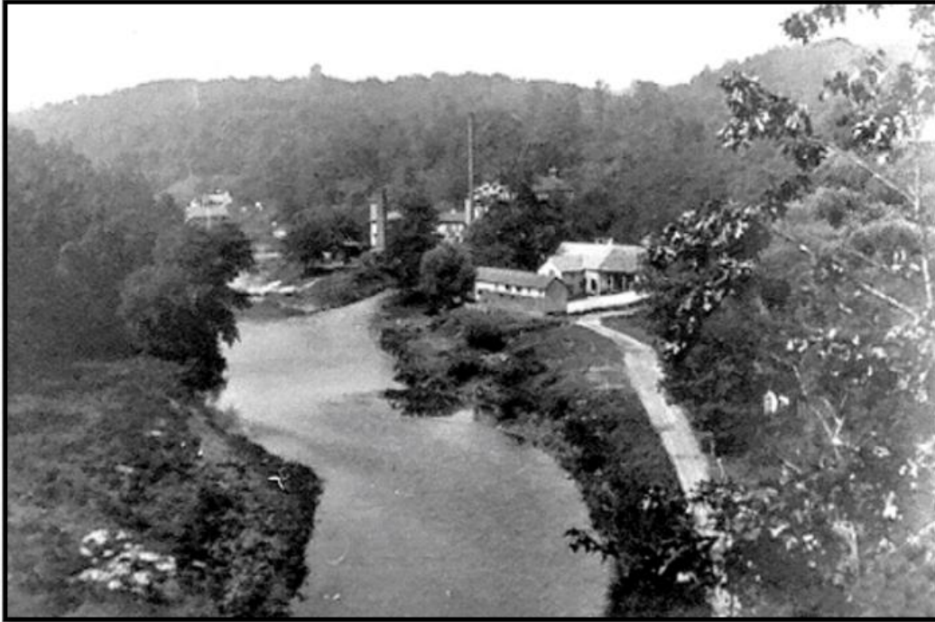
The mill town of Warren along the Gunpowder River, looking west.