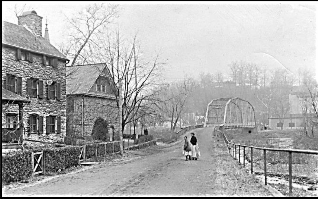
Warren Village Homes. Gunpowder Falls on right. Mill at distant right. Workers' houses on left.