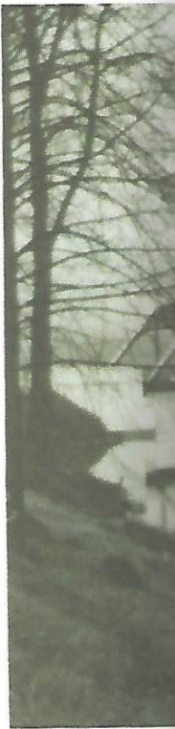
Bridge No. 1 on Loch Raven Drive, Baltimore County.

This map of the Loch Raven reservoir, prepared by the Loch Raven Fishing Center, has been annotated to show the location of new bridges built in the reservoir after the completion of the upper dam. Maryland Inventory of Historic Properties, BA-1138 Loch Raven Bridge #1." Retrieved from HSBC vertical file "Loch Raven Reservoir."