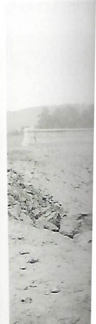
Bridge No. 1, also known as the Yellott Bridge, 1914, photograph.